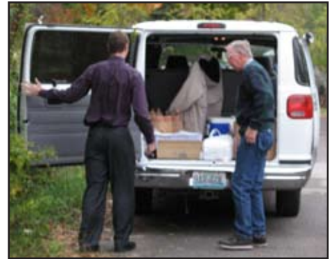
Loading up packets and people for the day in Oklahoma