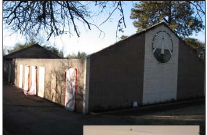
Above: Burned out shell of Grace Baptist Church

Services were held each evening during the distribution. On the Sunday after the distribution, the temperature in nearby Sacramento was a chilly twenty-two degrees. In spite of the weather, a good number of visitors attended the morning and evening services. At this writing they are still seeing visitors coming to the church, thanks to all of the pastors, churches and individuals who prayed and helped with this effort in Northern California. What