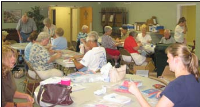
Mile Straight members getting packets ready to distribute

For more information on how RESEEDING AMERICA can help your church, please call us at Baptist International Missions at 423-344-5050.