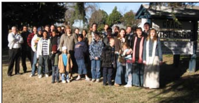
A good group from Bay area churches gather on a chilly Saturday morning to distribute packets for Grace Baptist.

a blessing to see the grace of God at work in these churches. This kind of support and cooperation must be what Paul was talking about when he thanked God for their fellowship in the Gospel to the Philippian church.