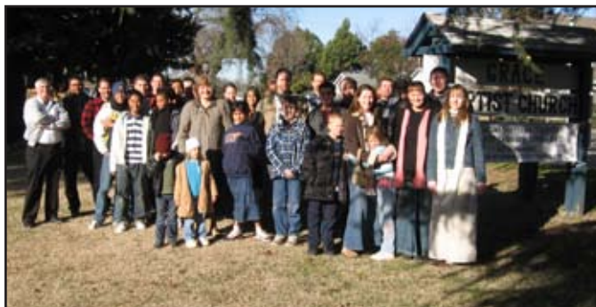
A good group from Bay area churches gather on a chilly Saturday morning to distribute packets for Grace Baptist.

a blessing to see the grace of God at work in these churches. This kind of support and cooperation must be what Paul was talking about when he thanked God for their fellowship in the Gospel to the Philippian church.