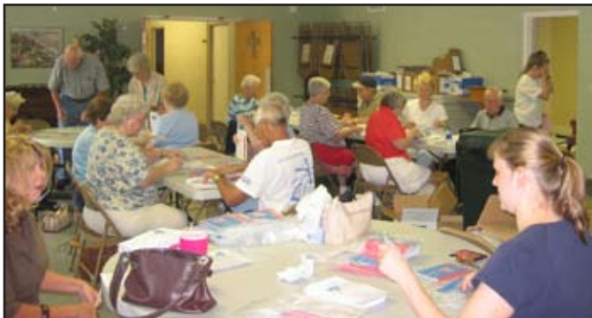
Mile Straight members getting packets ready to distribute

For more information on how RESEEDING AMERICA can help your church, please call us at Baptist International Missions at 423-344-5050.