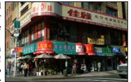
pictures from New York City