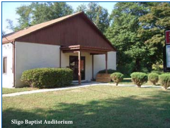
Sligo Baptist Auditorium

In a short period of time Sligo Baptist Church has gone from a decade of offering just one service on Sundays to the full array of services from Sunday School to a mid-week Bible study. Souls are being saved, lives changed and the average weekly attendance has climbed steadily. God