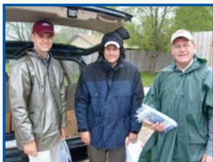
Grand Opening Sunday at Lighthouse Baptist Church